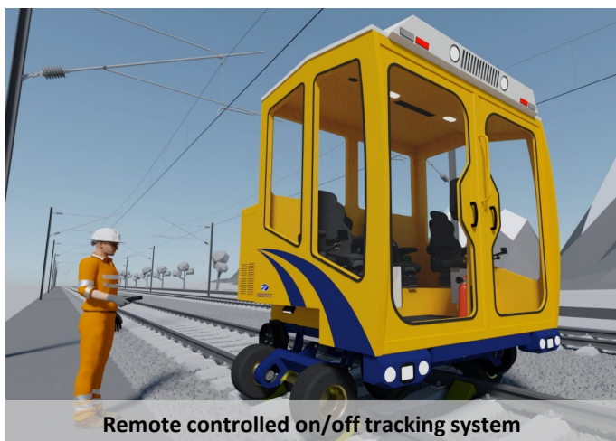
Remote controlled on/off tracking system