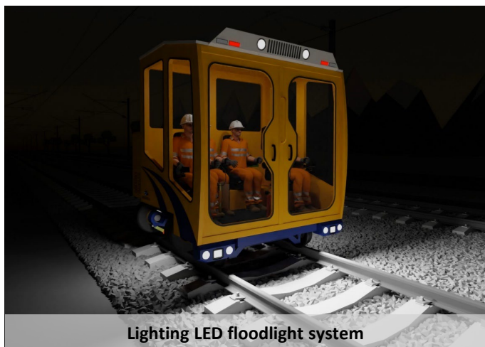
Lighting LED floodlight system