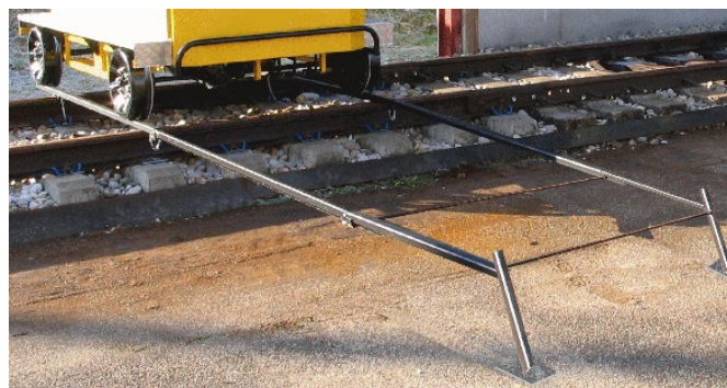
On/off tracking device