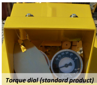
Torque dial (standard product)