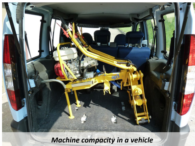
Machine compactness in a vehicle