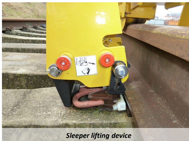
Sleeper lifting device