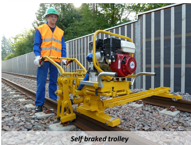
Self braked trolley