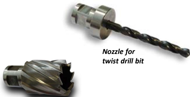
Hollow drill bit