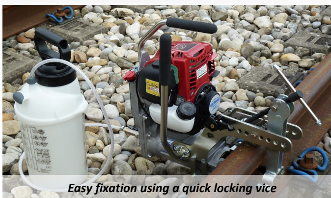
Easy fixation using a quick locking vice